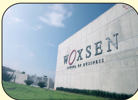
Woxsen School of Business