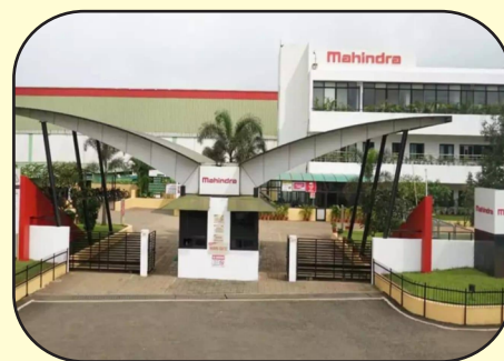
Mahindra Tractor Unit